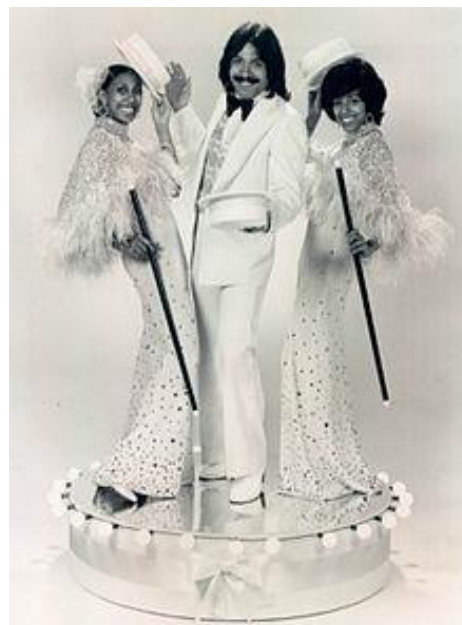
Image of Tony Orlando and Dawn